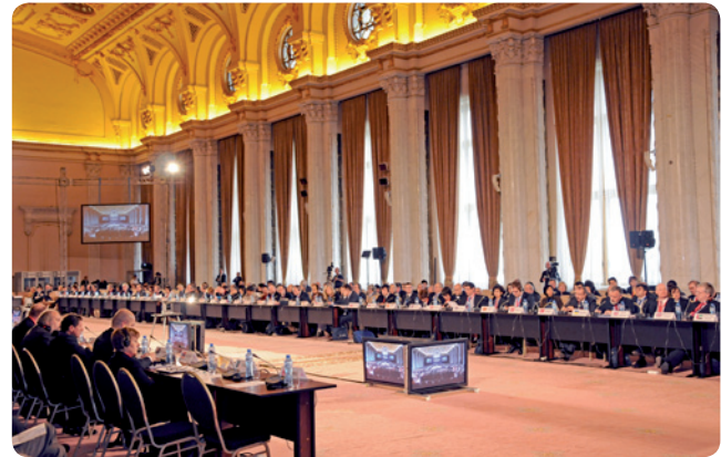
EHEA Ministerial Conference, April 2012, București

Ministers further asked EQAR to cooperate with the E4 group, Education International and BUSINESSEUROPE in the revision of the European Standards and Guidelines (ESG, see 2.3 below).