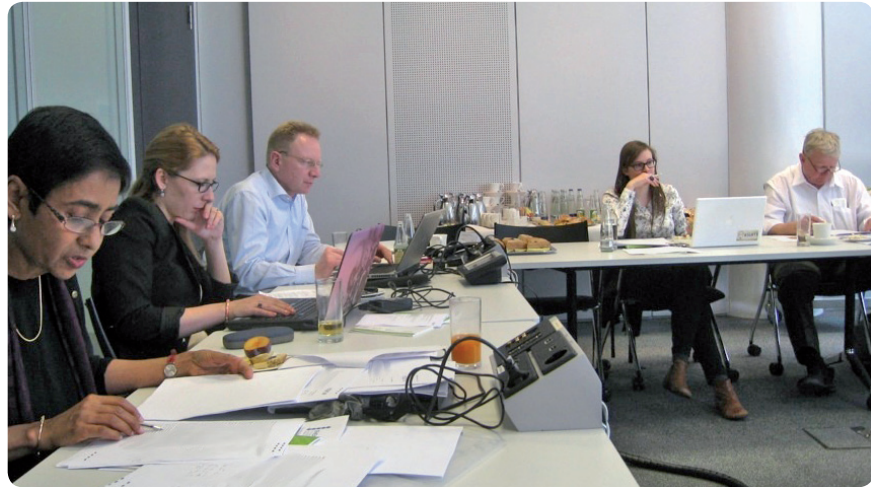
Register Committee, May 2012, München

Whereas eligibility was so far only officially verified once an application was made, a new process is now available to determine an agency's eligibility before it undergoes an external review and makes an application. This will avoid situations where an agency undergoes an external review without being able to use that review in the end.