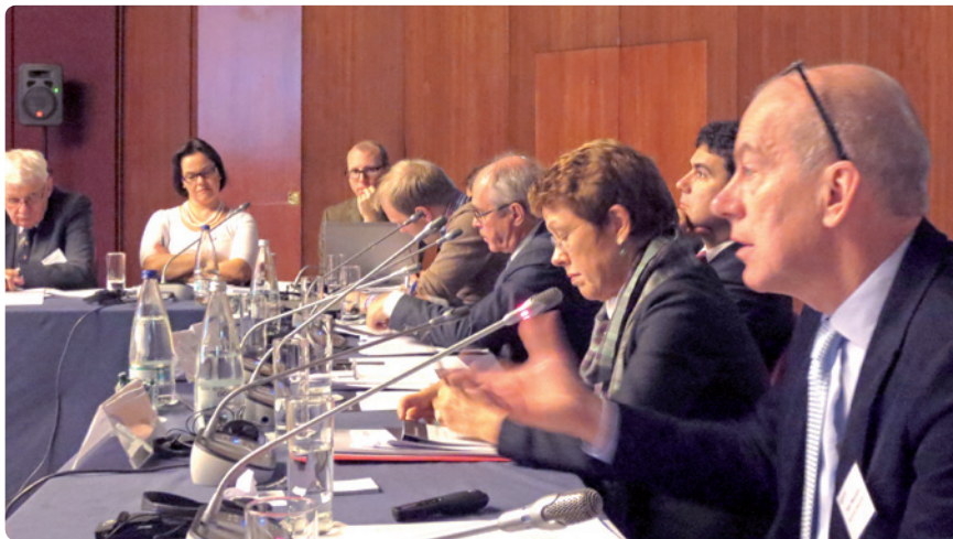
Members' Dialogue, October 2012, București

As a first step, the Steering Group considered the context, scope, purposes and principles of the revised ESG. The Steering Group prepared to launch an open call for concrete suggestions in early 2013, targeting the Bologna Follow-Up Group (BFUG) as well as other interested contributors.