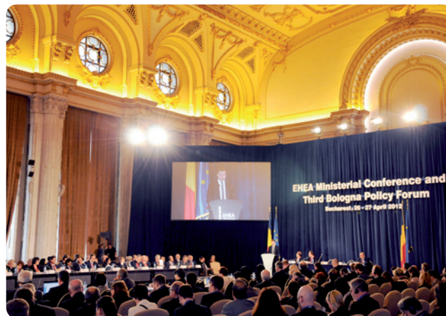
EHEA Ministerial Conference, April 2012, București

The Bucharest Communiqué commitment to allow EQAR-registered agencies to perform their activities across the EHEA is in line with the objectives formulated for EQAR at the outset, i.e. to: “provide a basis for national authorities to authorise higher education institutions to choose any agency from the Register, if that is compatible with national arrangements” (E4 Report to the London Summit, 2007). This objective has since formed a key element of EQAR’s mission and strategic priorities.