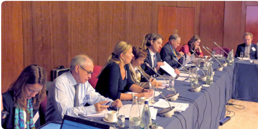
Members' Dialogue, October 2012, București

The full Strategic Plan can be found in Annex 1 .