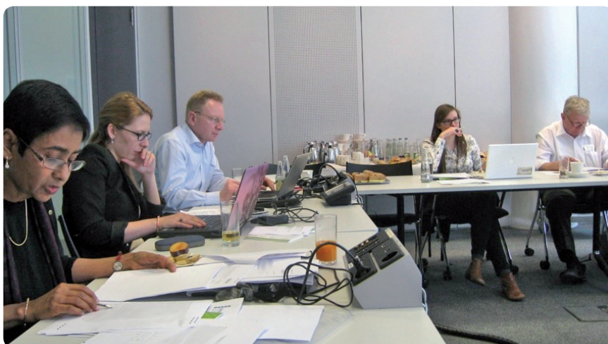
Register Committee, May 2012, München

Whereas eligibility was so far only officially verified once an application was made, a new process is now available to determine an agency's eligibility before it undergoes an external review and makes an application. This will avoid situations where an agency undergoes an external review without being able to use that review in the end.