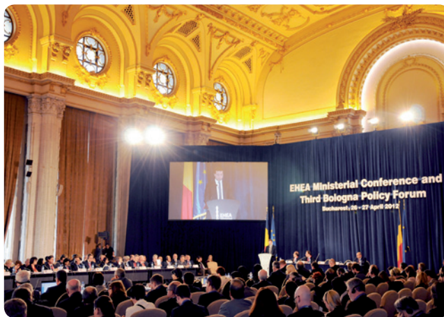
EHEA Ministerial Conference, April 2012, București

The Bucharest Communiqué commitment to allow EQAR-registered agencies to perform their activities across the EHEA is in line with the objectives formulated for EQAR at the outset, i.e. to: "provide a basis for national authorities to authorise higher education institutions to choose any agency from the Register, if that is compatible with national arrangements" (E4 Report to the London Summit, 2007). This objective has since formed a key element of EQAR's mission and strategic priorities.