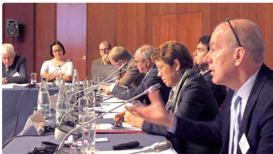
Members' Dialogue, October 2012, București

As a first step, the Steering Group considered the context, scope, purposes and principles of the revised ESG. The Steering Group prepared to launch an open call for concrete suggestions in early 2013, targeting the Bologna Follow-Up Group (BFUG) as well as other interested contributors.