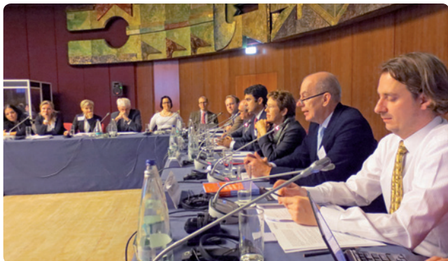
Members' Dialogue, October 2012, București

The analysis will inform stakeholders and policy makers, and enable them to build on experiences from different EHEA countries.