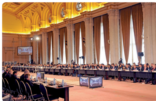
EHEA Ministerial Conference, April 2012, București

Ministers further asked EQAR to cooperate with the E4 group, Education International and BUSINESSEUROPE in the revision of the European Standards and Guidelines (ESG, see 2.3 below).