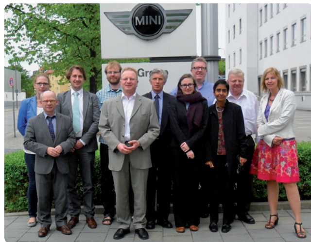
Register Committee, May 2012, München

At its meeting on 1 December 2012, the Register Committee considered the progress of the ESG Revision and commented on draft documents under discussion in the Steering Group.