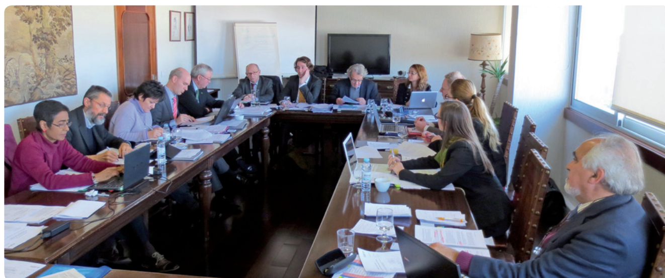
Register Committee, December 2012, Aveiro

situations where an agency's current practice differs substantially from the situation when it was reviewed against the ESG and admitted to the Register. However, only in cases of serious concerns about whether a registered agency continues to comply substantially with the European Standards and Guidelines (ESG) the Register Committee will consider further action, such as an extraordinary review of registration.